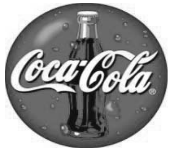
The contract with Coke is up, evidence that our "evil" capitalist system is working just fine