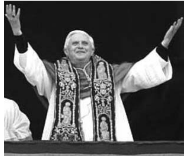
Pope Benedict XVI stirs up religious tensions within the Muslim community

Father Halstead explains, "There must be