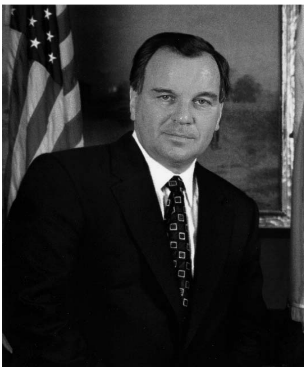
Daley enables capitalism and freedom to continue through his use of the veto

The Big Box ordinance has placed Chicago in the center of a heated debate over a so-called "living wage" that has drawn national attention. Congressman Jesse Jackson, a proponent of the measure,