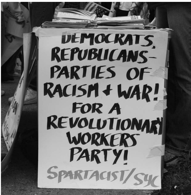
What: Revolutionary Workers Party (triple kegger) When: June 5th 10:00 PM Where: Cultural Center Wear: Your commie outfits and bring your hammer and sickle