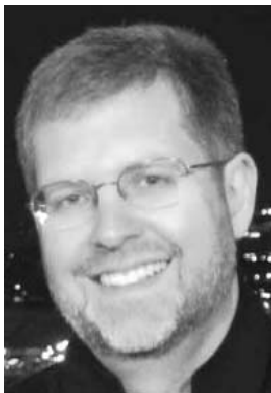
Seriously, how sexy are those pearly whites?