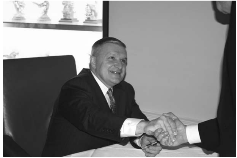
General Zinni thought Operation Iraqi Freedom to be a military wonder

During Q&A, Zinni took the chance to explain his views on what Iraq should do with its feared militias. Zinni didn't hide the fact that "Arabs love guns" and trying to push aside these localized forces would be a huge mistake for the country. His response was that instead of making the militias go underground, Iraq should