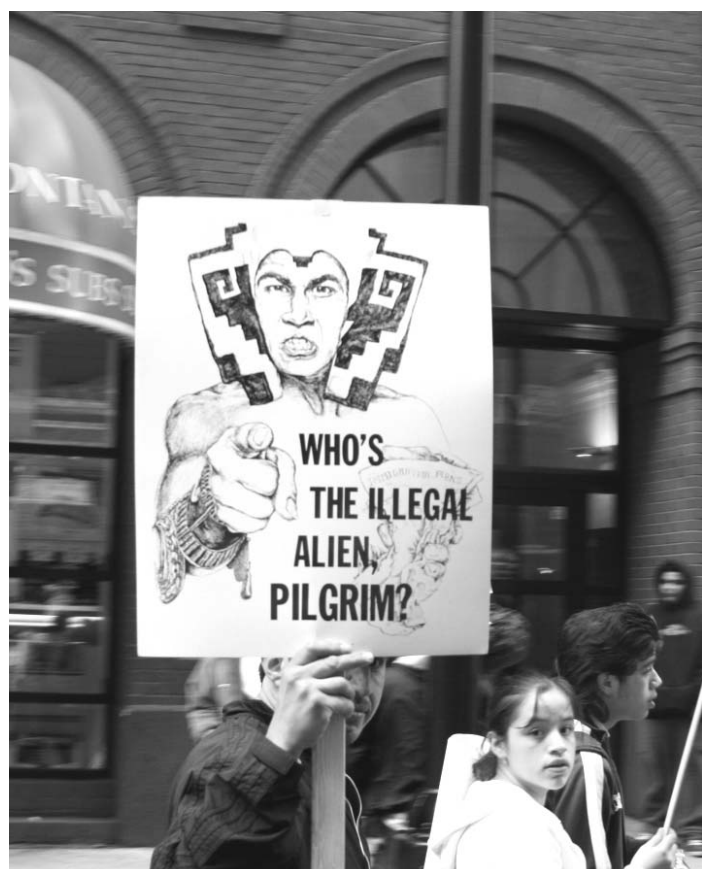
Who's the Pilgrim, Illegal Alien?