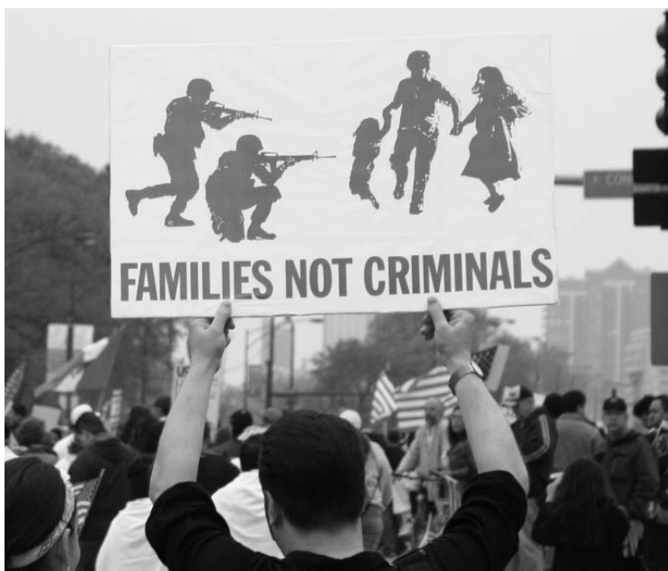
Are families exempt from the law?