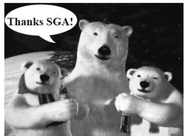
These bears, in cooperation with SGA, remind you to enjoy Coca-Cola

The new measure, clocking in at a much more solid 10-1-3 vote reflects not only the fact that Coke voluntarily submitted to UN inspections, but also conceded that the boycott "failed to attract widespread consensus on campus." The Statesman would like to take this opportunity to praise the body for its maintenance of integrity.