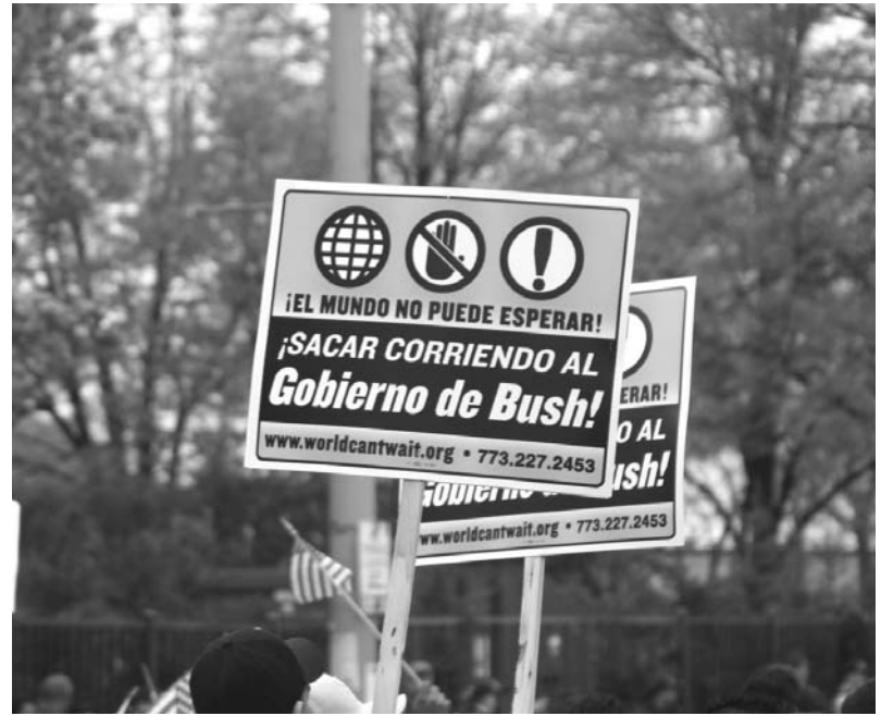
Uhh, in English please