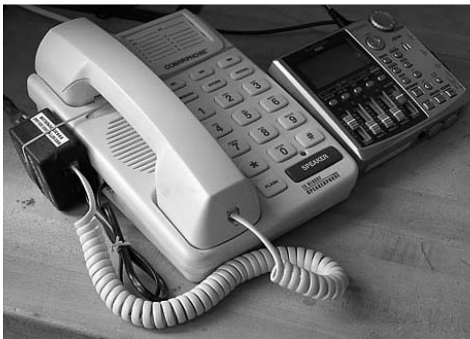
A key weapon on the War on Terror is spying on our suspected enemies through use of wiretapping

FISA has been a tool for the liberals to attack the President on the NSA's activities, however if the liberal mentality was literate, they would understand that FISA itself does not support their argument. FISA says that it prevents government from "engaging in electronic surveillance under color of law except as authorized by statute [emphasis added]." The Court recognized the AUMF and confirmed it as a statute of approval from Congress in Hamdi v. United States . Not to mention that "the FISA Court of Review itself recognized just three years ago that the President retains constitutional authority to conduct foreign surveillance apart from the FISA framework." Why doesn't the President just obtain a warrant anyway, even though he doesn't legally have to? The President has a compelling interest in protecting the nation's citizens' lives. Technology, furthermore, moves at a much faster rate; one second cannot be wasted nor can we risk having national security information exposed in the courtroom. The Court has said, in Haig v. Agee , "it is obvious and unarguable that no government interest is more compelling than the security of the Nation." I am not a pessimist and I don't believe that this country is moving towards an Orwellian state. I do not hold the liberal mentality of paranoia; the government is not out to get you.