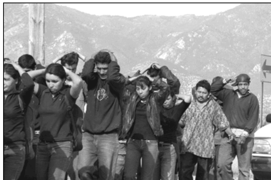
You have the right to remain silent...wait, you're illegal, you have no rights

The Statesman believes that the key to a legal temporary guest worker program in being successful is ensuring that employers only hire employees with legal status. We must penalize the employers of illegal workers. This starts by enforcing laws that we already have, demanding that employers verify citizenship of anyone they hire. It should be made financially unattractive to business to risk hiring illegal workers anymore in this country. Social services are for American citizens, not illegal aliens who have broken the law. In anything other than life or death emergency services, illegal aliens should be denied service, and even in the case of emergency, it should be reported to the ICE and deportation arranged as soon as the medical crisis is over. We are not here to take care of Mexico's poor; we have plenty of our own to worry about.