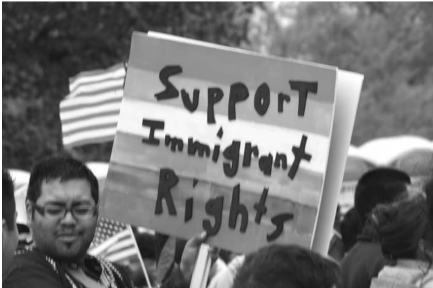
As usual, the protestors confuse law-abiding immigrants with law-breaking illegal immigrants