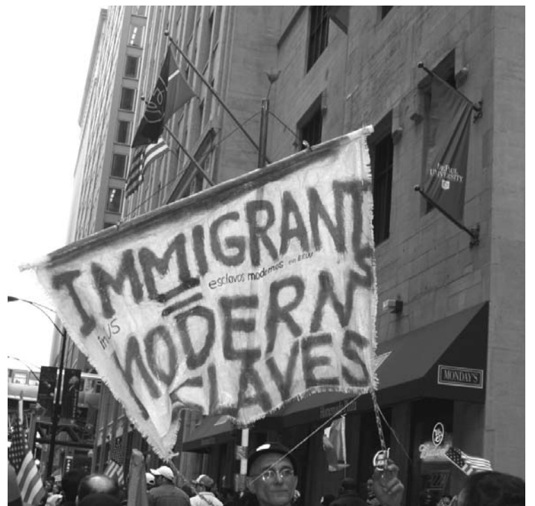
Great argument...millions hop the border fences and risk their lives to become enslaved?